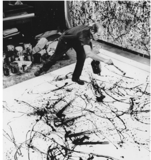
Jackson Pollock at work in his studio, 1950