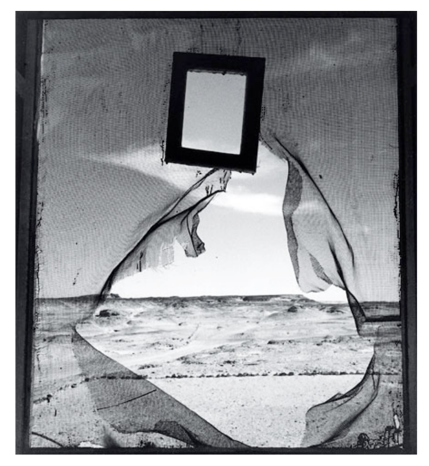
Lee Miller - Portrait of Space, frame 4, final version, 1937